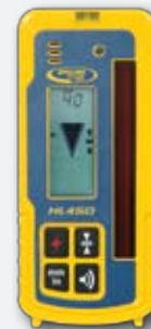
HL450 Laserometer included with GC package